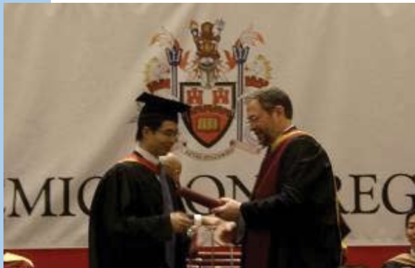
University of Northumbria at Newcastle Congregation held at the Hong Kong International Trade and Exhibition Centre on 9 March 2006