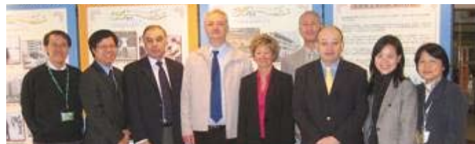
Panel members taken with staff at the Morrison Hill IVE, where the LMU BA (Hons) Marketing is being conducted.

Vocational Training Council first signed a partnership agreement with the Leeds Metropolitan University and had gone through the "recognition" event in 1999. The current round of "re-recognition" took place from 21st -22nd March 2006 with the Leeds Met Panel visiting VTC in Hong Kong. This is part and parcel of the Leeds Met's quality assurance process. SHAPE has been given the approval again to offer Leeds Met programmes for another 5 years. On 21st March 2006, the Panel visited several IVE campuses at Morrison Hill, Tsing Yi and SBI, and members were impressed by the quality of the facilities available to both staff and students.