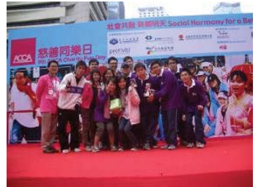
Congratulations to the Team!