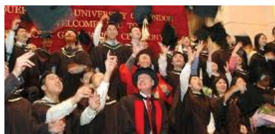
University of London (Queen Mary) Congregation held at the Langham Place Hotel on 18 November 2005

A total of 515 new graduates attended the congregation ceremonies held in October and November 2005, as well as in March 2006. They came from three of our partner universities --- Leeds Metropolitan University, University of London (Queen Mary), and University of Northumbria at Newcastle.