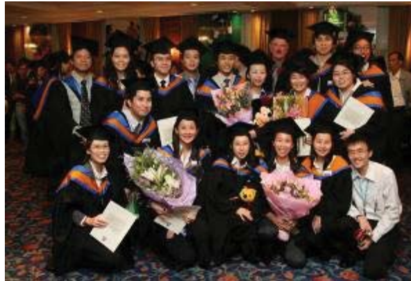
Leeds Metropolitan University Congregation held at the Hong Kong Football Club on 29 & 30 October 2005